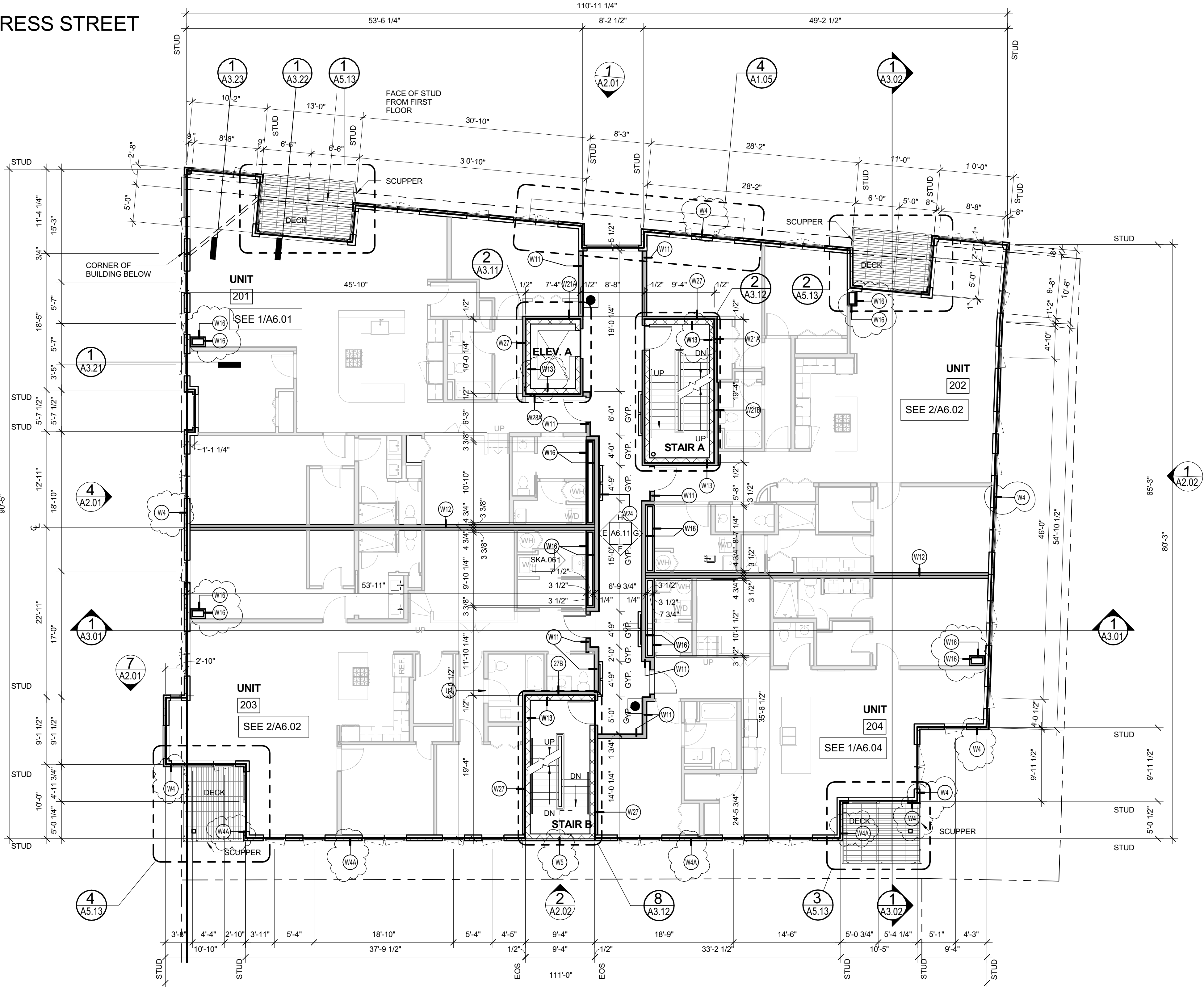
1 SECOND FLOOR PLAN 1/8" = 1'-0" 0 2'-0" 4'-0" 8'-0" 16'-0"